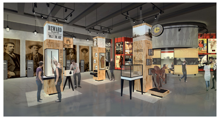
Exhibit renderings of the future U.S. Marshals Museum

THE U.S. MARSHALS MUSEUM usmarshalsmuseum.org