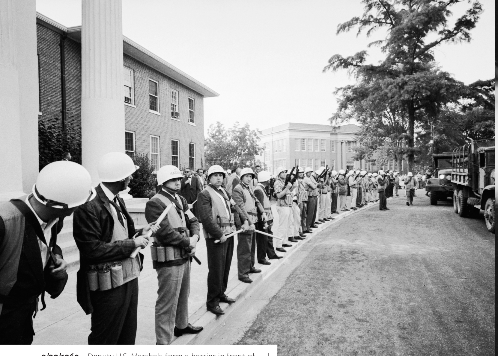
9/30/1962 – Deputy U.S. Marshals form a barrier in front of the Lyceum Building on the University of Mississippi campus to keep out protesters over desegregation of the school.

As the sun rose, federal troops were pushing the last of the rioters from campus and inspecting the damage. The campus still smelled of tear gas, there were burned-out vehicles, and bullet holes marked the white columns of the Lyceum Building. But the school itself suffered very little. Officials decided to continue normal operations that day, and encouraged students to attend classes as they normally would. The cost in human life was higher. Two men were confirmed killed and hundreds injured. Some 160 deputy marshals were injured, with injuries ranging from gunshot