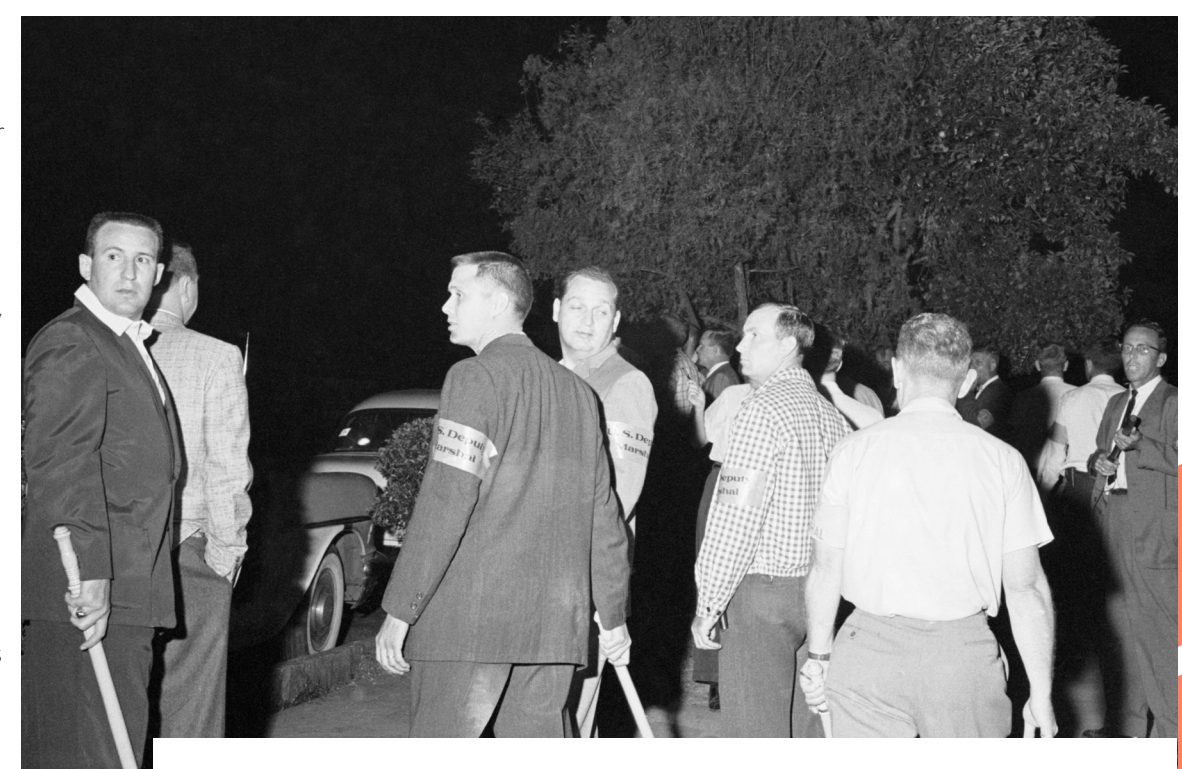
5/21/1961 - Deputy U.S. Marshals, signified by their armbands, guard the First Baptist Church in Montgomery, Ala., where Dr. Martin Luther King Jr. was speaking. A large crowd gathered, eventually requiring the deputies and local police to use tear gas to disperse them. The National Guard was later called out to prevent further incidents.

On March 7, the marchers began their first attempt. As they crossed the Edmund Pettus Bridge leading out of Selma, they were stalled by state troopers and other local police who instructed them to turn back.